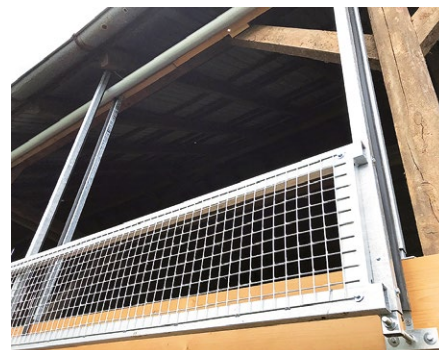
Welded wire mesh