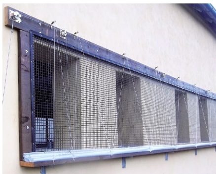
Timbering for side ventilation systems