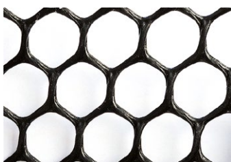
Mesh H12 black

It's a Netlon mesh that lets 80% of the air. It is used as a support net to the side Type A ventilation systems. Size: 2 x 35 m.