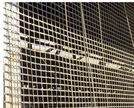
Meshes and nets